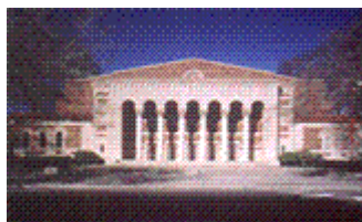
The Memorial Auditorium was constructed in 1926 and reopened in the fall of 1996 after undergoing a ten-year closure and renovation.